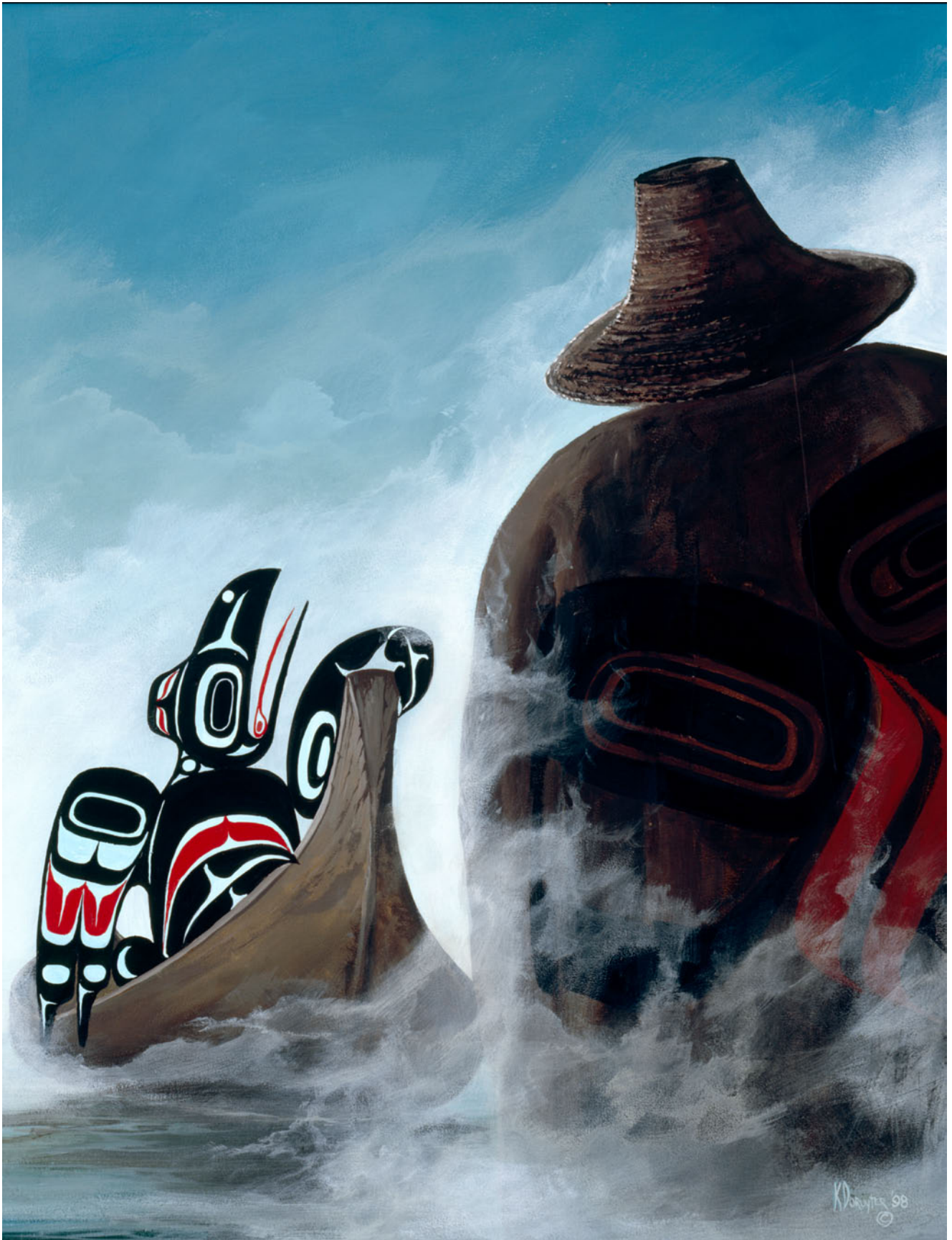
Origin of Fog