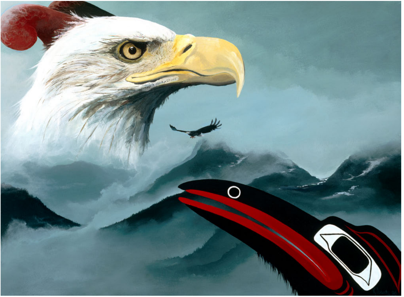
How death came into the world

To this day one can still hear at times the usual defiant cries of Raven turn into haunting, keening mews as he grieves for his lost son.