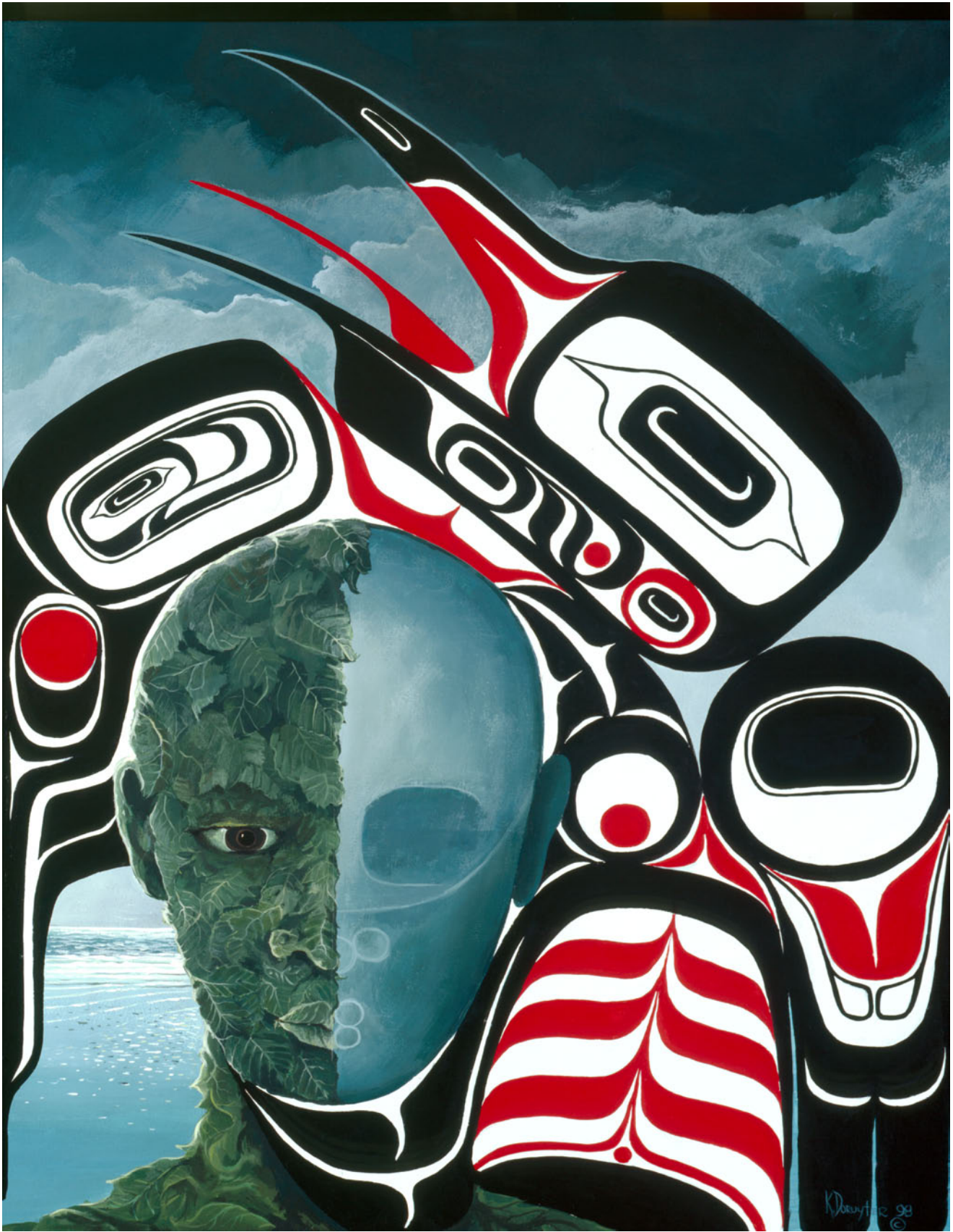
Origin of humans