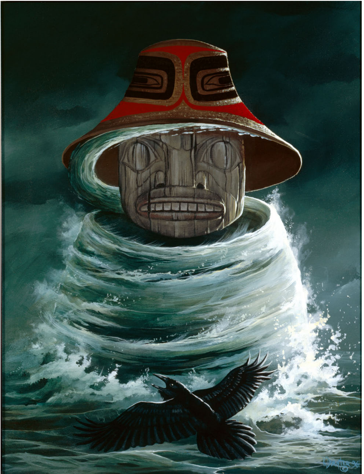
The deluge or how Raven achieves dominion over the ocean waters