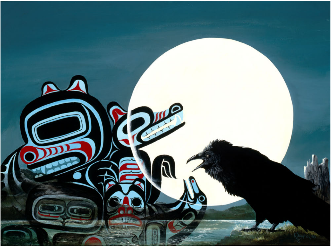
Raven releases light and creates other animals

Alarmed by this turn of events, the frightened fishermen thought only of escape. Some jumped into the water, while others ran into the woods. Those who chose to swim became sea creatures - seals, walrus, otter and the like. Those who stayed on land turned into deer, moose, and bear. Perhaps this is why we still think of all these beings as humans in disguise. It certainly explains why some animals, on occasion, choose to resume their human form.