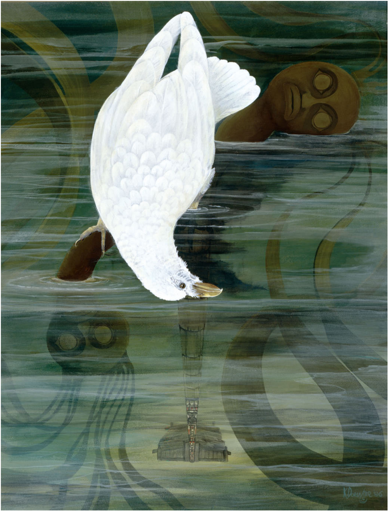
Origin of land 2