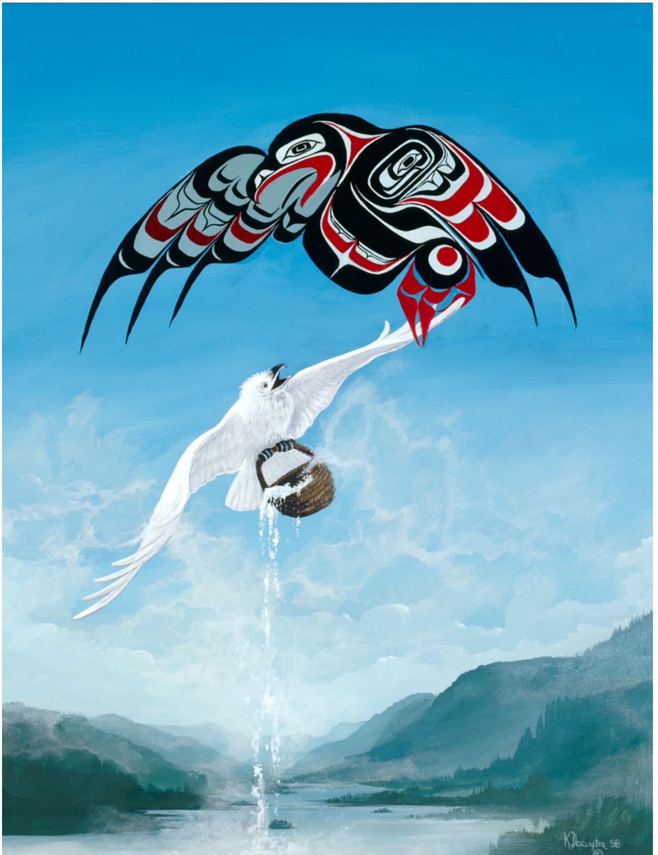
Origin of rivers and streams