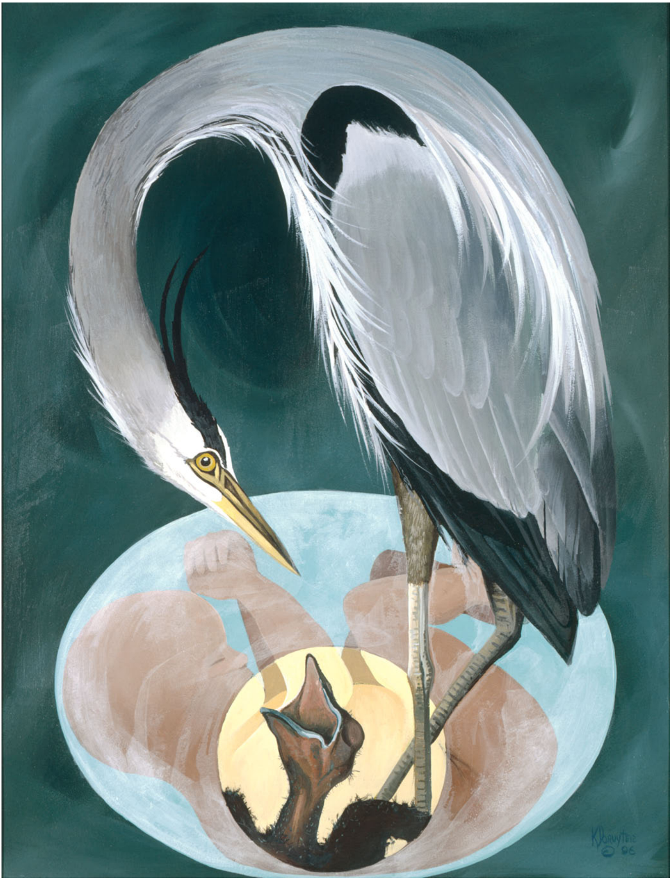
Birth of Raven