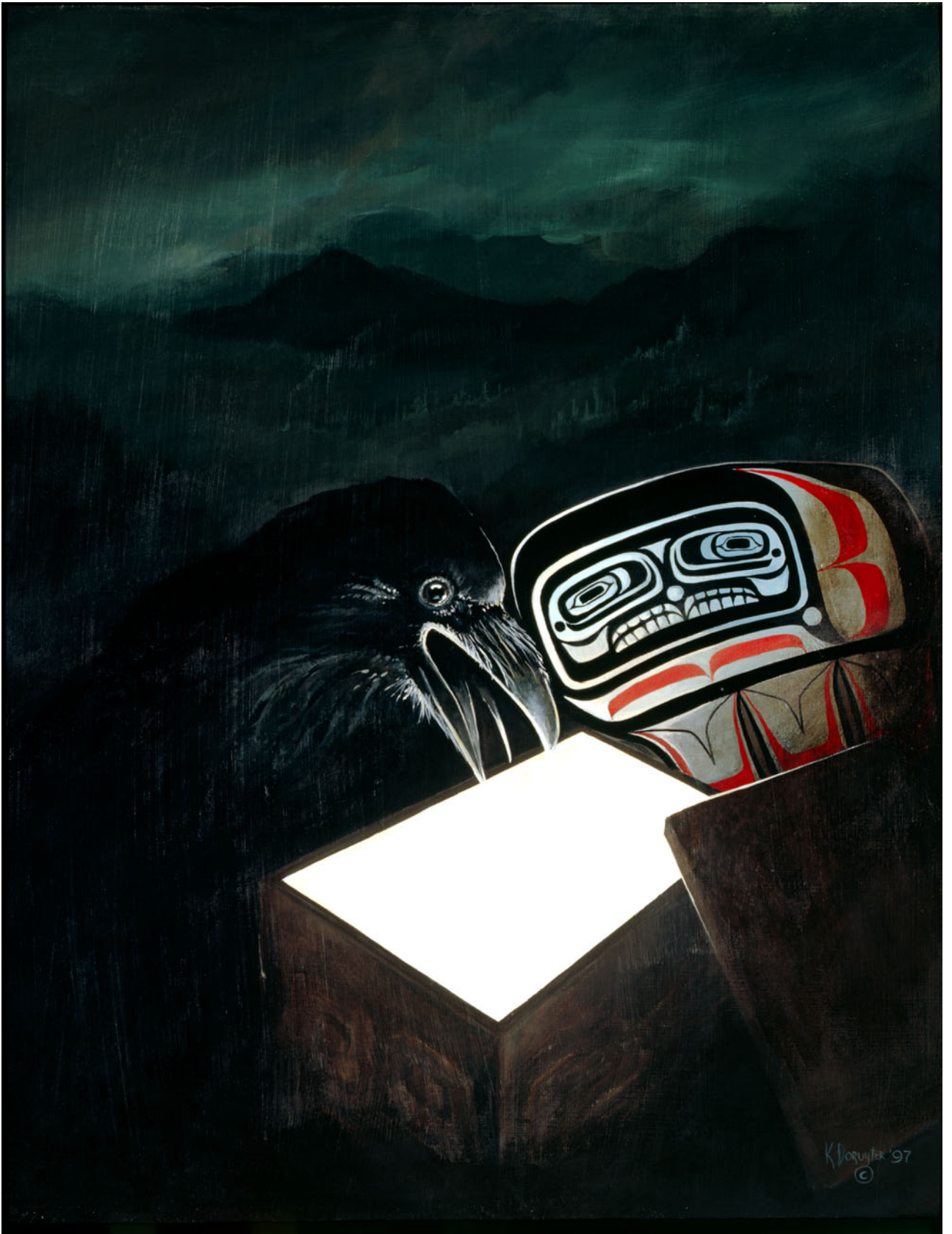
Theft of light