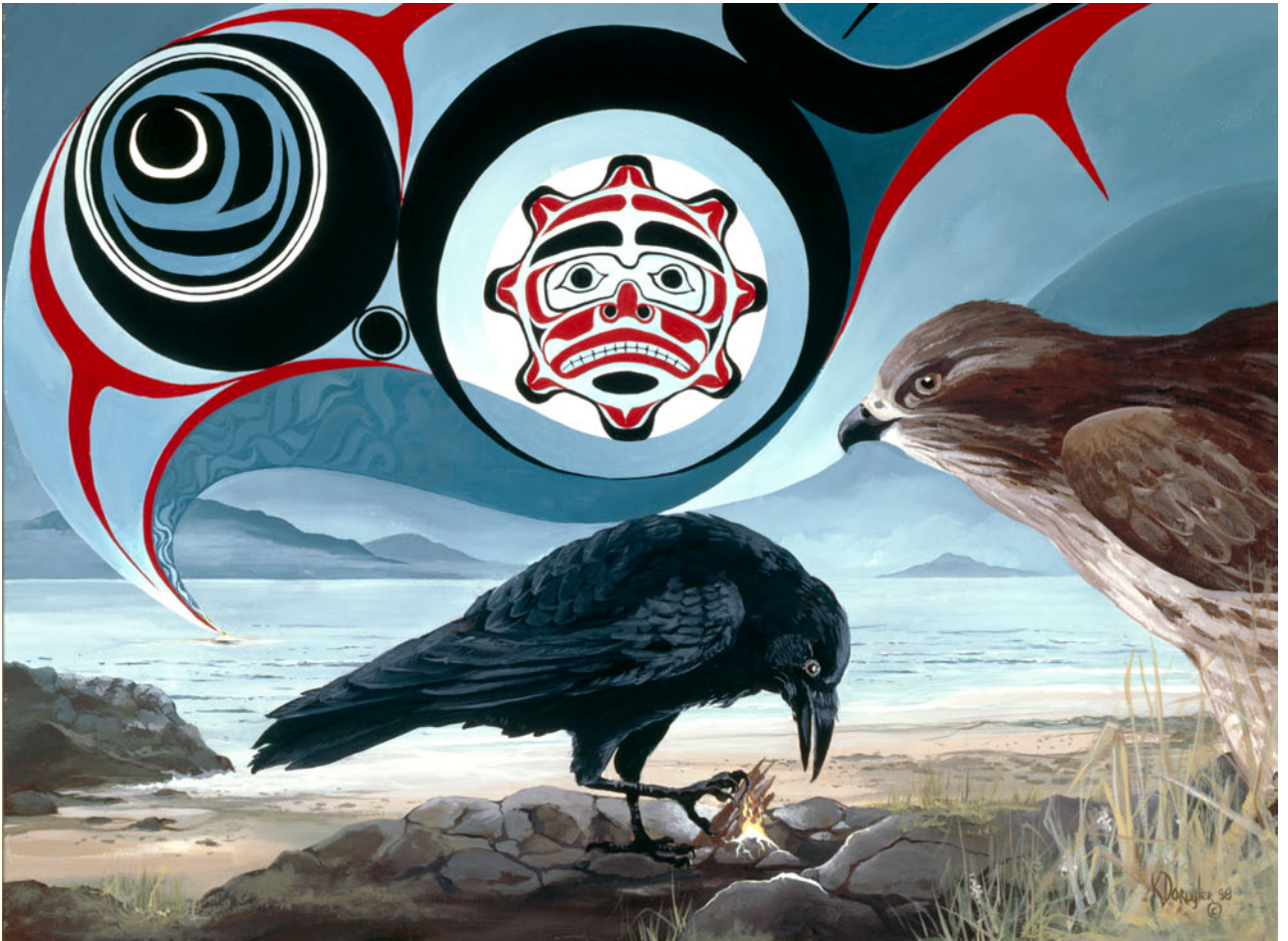
Theft of fire

In the north-west, Raven is usually the principal character of this tale. He discovers and instigates the seizure of Fire, if it cannot be bought. In most cases Fire appears floating on the water by itself, is situated on an island, or rests on some type of structure. The act of actually fetching Fire, or trying to, has been attributed to Deer (loses its tail), Hawk, Swallow, or Owl (loses a large portion of their beaks), Snake, Turtle and Spider. In some tales even Raven himself, either in his own form or disguised, steals Fire. It has been said that Raven turned black because he was burned by stealing Fire rather than Light.