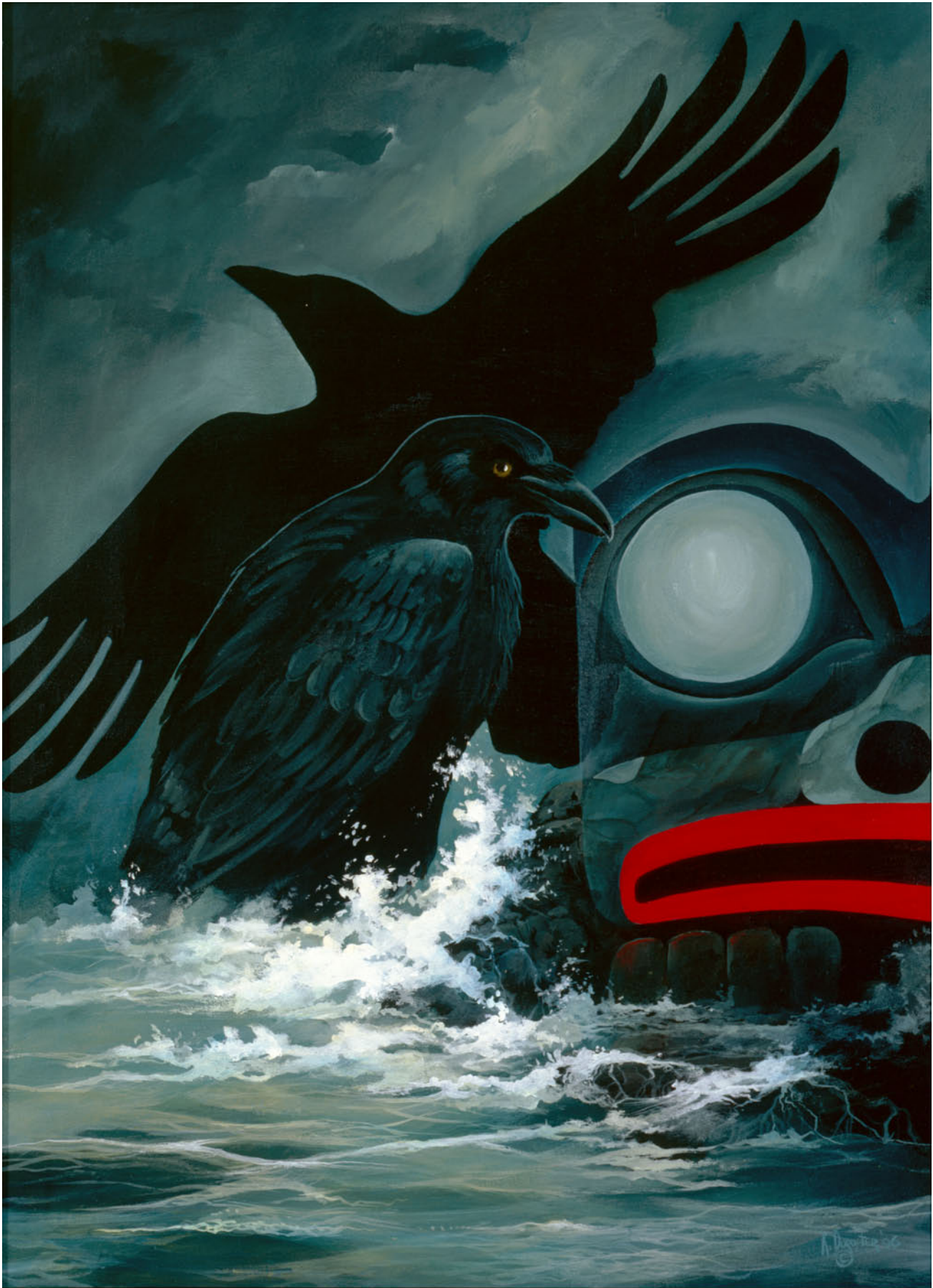
Origin of land 1